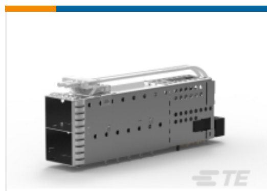
TE Part # 2-2296273-1 MICROQSFP 2X1 CAGE ASSY EMI SPRING, 2LP