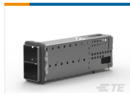
TE Part # 2296273-2 MICROQSFP 2X1 CAGE ASSY EMI GASKET