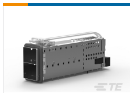
TE Part # 2-2296273-2 MICROQSFP 2X1 CAGE ASSY EMI GASKET, 2LP