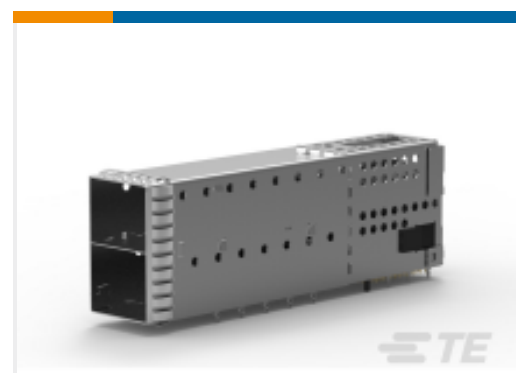
TE Part # 2296273-1 MICROQSFP 2X1 CAGE ASSY EMI SPRING