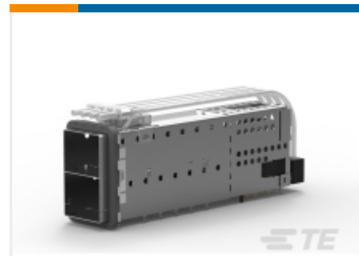
TE Part # 4-2296273-2 MICROQSFP 2X1 CAGE ASSY EMI GASKET, 4LP